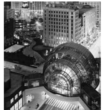
The Arts Garden