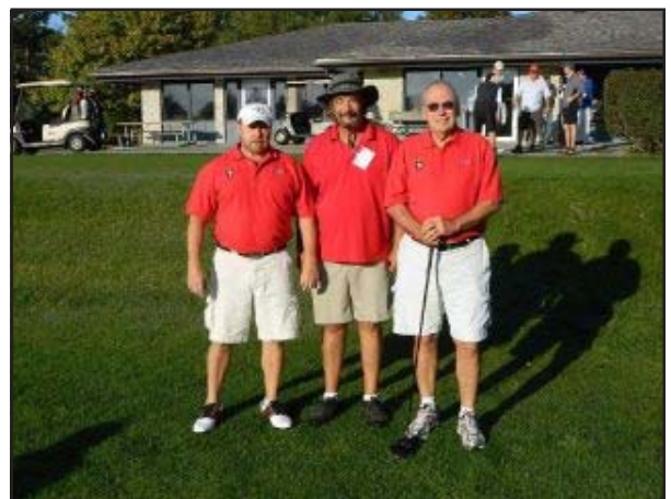
Time out for Golf at 2011 Reunion